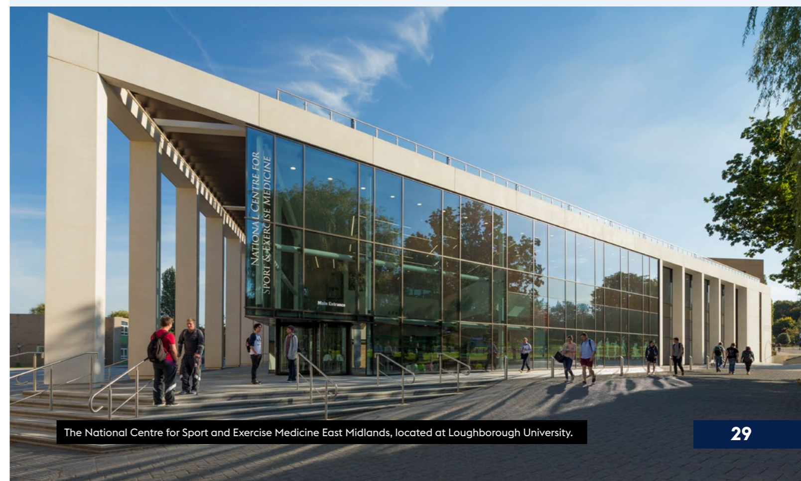
The National Centre for Sport and Exercise Medicine East Midlands, located at Loughborough University.