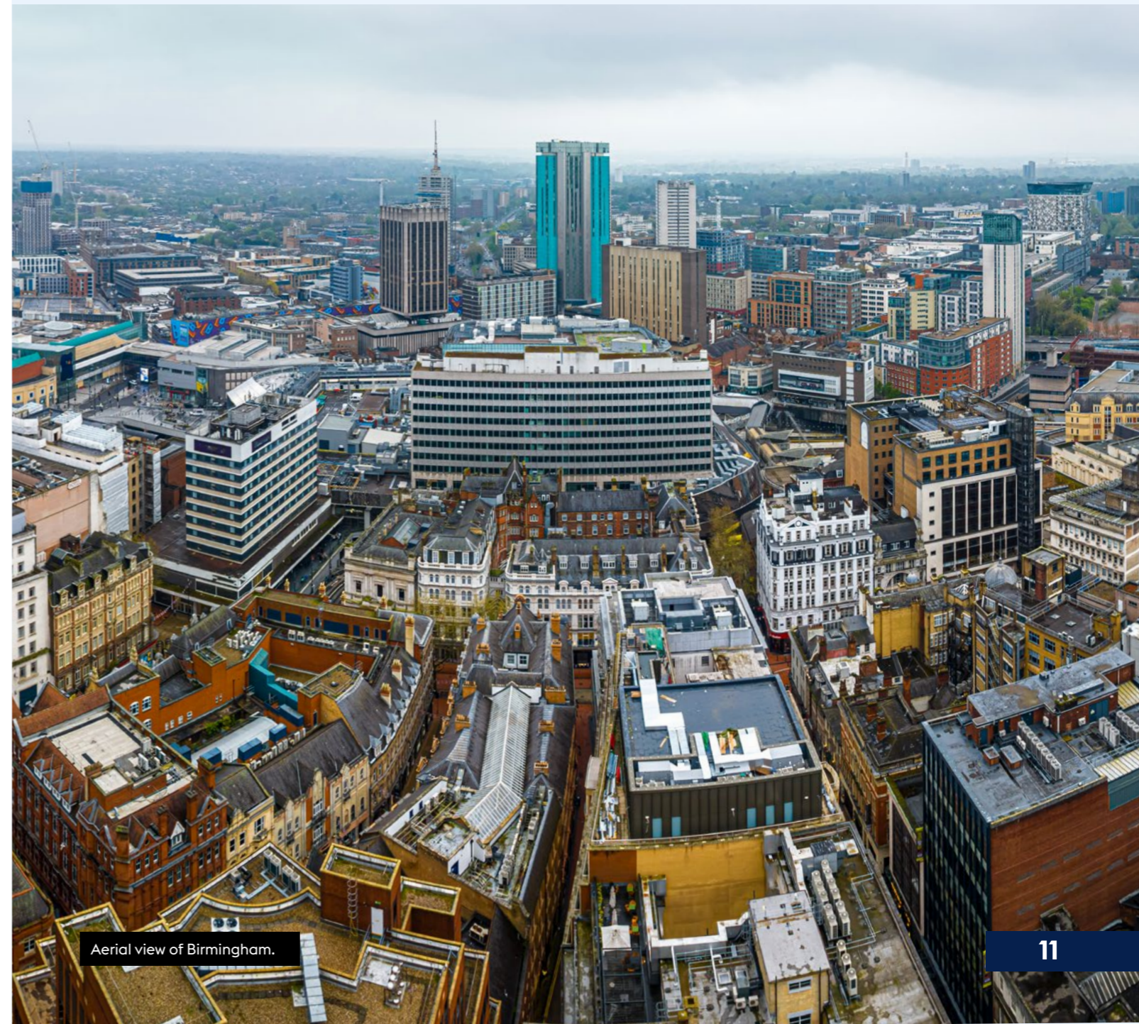
Aerial view of Birmingham.

Health and Life Sciences is a growing super cluster within the Midlands, with 93% company growth in the last decade. With 420 businesses incorporated since 2017 and 34 spinouts currently being tracked, the growth looks set to continue. Prominent cluster locations are Birmingham and Nottingham. There are established organisations such as Medilink Midlands and the Health Innovation networks, dedicated Life Science Opportunity Zones in Birmingham and Charnwood at Loughborough, as well as private incubator spaces such as BioCity in Nottingham: there is a robust cluster support infrastructure across the region for any life sciences investor looking to innovate, research and grow their business.