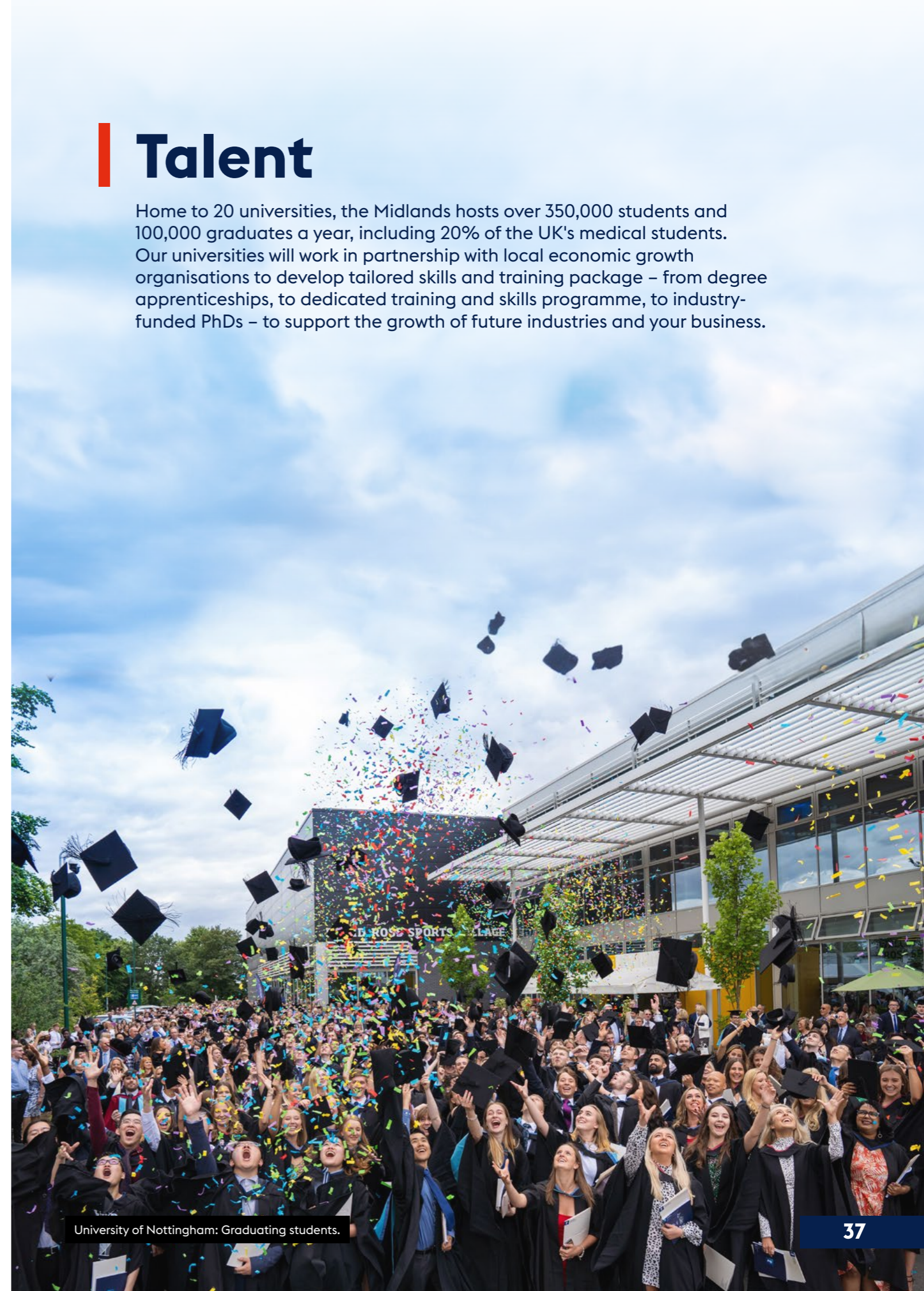
University of Nottingham: Graduating students.

Home to 20 universities, the Midlands hosts over 350,000 students and 100,000 graduates a year, including 20% of the UK's medical students. Our universities will work in partnership with local economic growth organisations to develop tailored skills and training package – from degree apprenticeships, to dedicated training and skills programme, to industry-funded PhDs – to support the growth of future industries and your business.